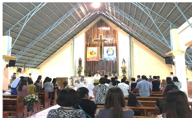
The interior of the church of Saint Jude Thaddeus, Pagudpud