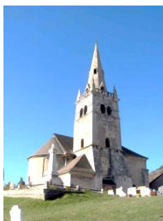
The Eymard Chapel, a place of “prayer”.

The Eymard Exposition (69 rue du Breuil), a place of “memorial”.